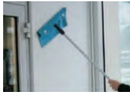
Reflex Mopping System